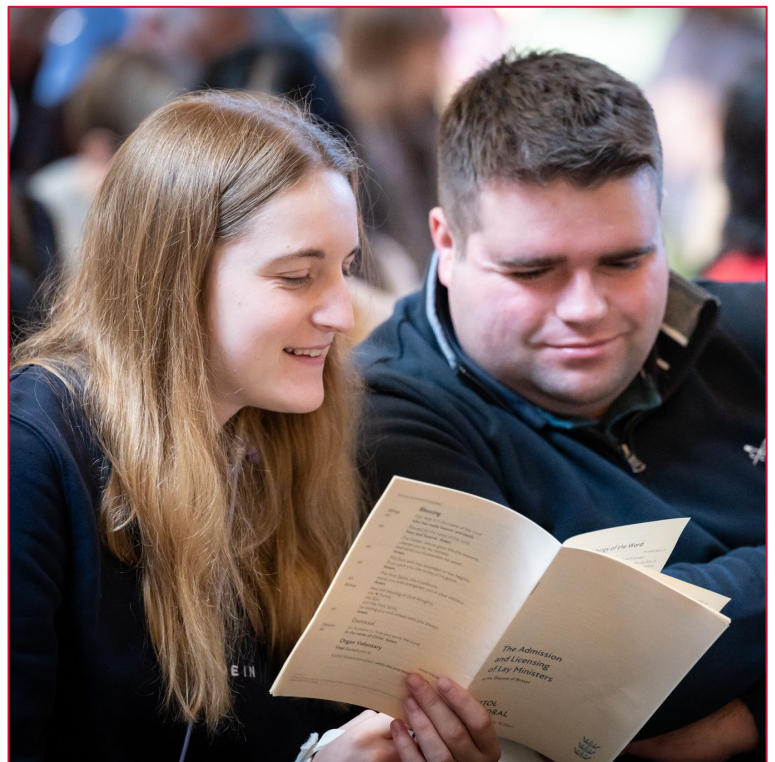
The Cathedral community is supportive, kind and thoughtful, it is a joy and nourishing to be in this inspiring building (a longstanding member of the congregation)

This role will suit you if you are looking for significant leadership opportunities and have the humility and humour to work well in a diverse team.