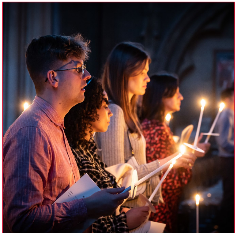
Bristol Cathedral is a place where I can be myself and not feel judged (teenage server)

bristolonecity.com/about-the-one-city-plan/