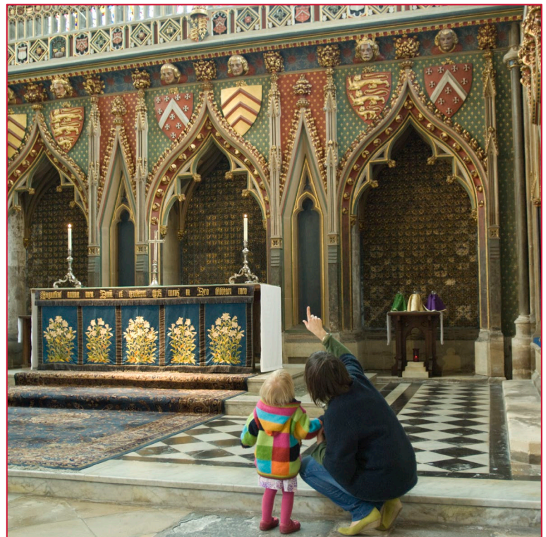
For me it is the wow factor when you walk through the doors of the Cathedral and the spiritual feeling of Gods ever presence. (Cathedral welcomer)

Our congregation is varied, but theologically literate and discerning. They enjoy being challenged by thoughtful teaching and preaching. Many have a strong heart for social justice and are actively engaged in the life of the city.